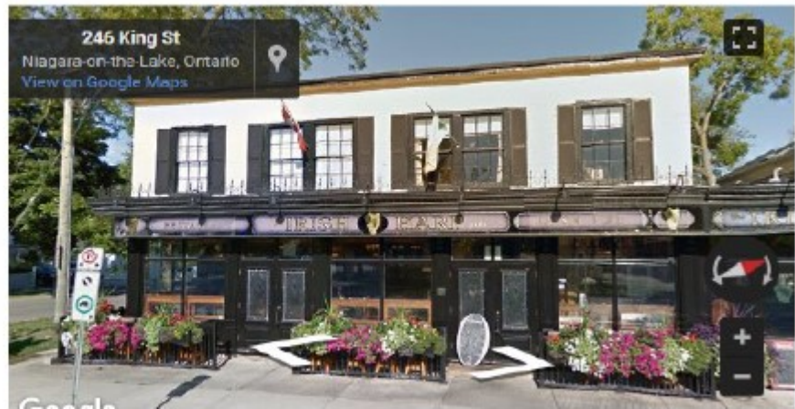
Irish Harp Pub 246 King Street Niagara-on-the-Lake

PARKING??? There is a pay as you stay parking lot just east of the restaurant. However, there is free parking allowed on the streets 1 block away from the restaurant, if walking is no problem.